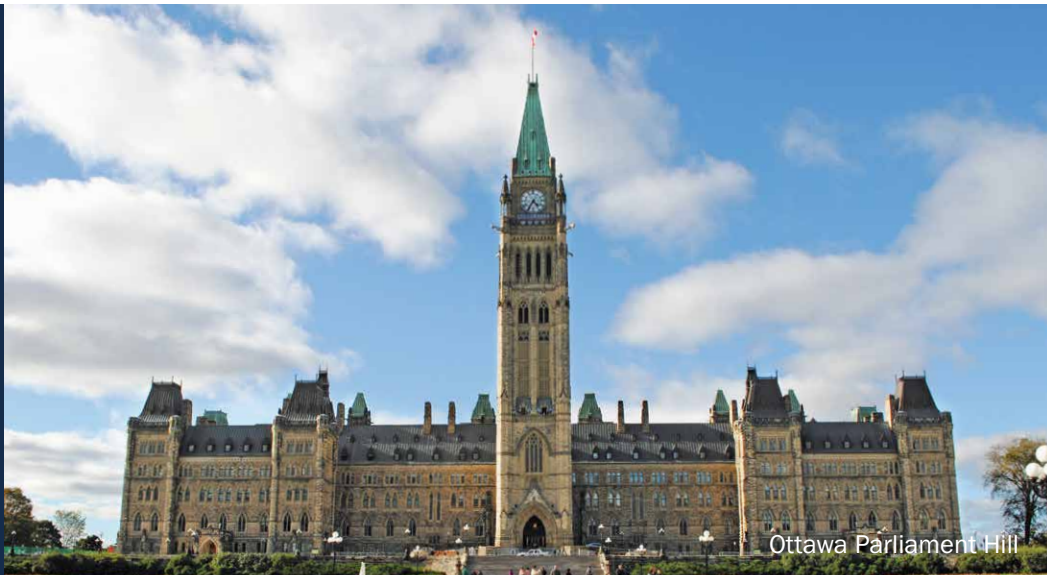
Ottawa Parliament Hill

In both programs, students improve their academic standing through five (5) to six (6) hours of daily instruction while experiencing Canadian culture, and improving their leadership and social skills. This stimulating academic and social environment engages students in exciting activities and excursions to national and provincial historical and modern attractions while providing them an opportunity to make life-long friends from around the world.